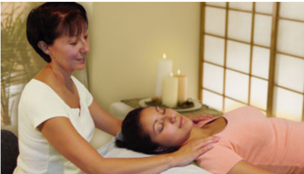
Reiki can be used with anyone to soothe and nurture, no matter their age or situation.

There are different kinds of ki , and we absorb it from different sources — food, sun, water and air. We also give it to and receive it from other people, which is where healing techniques that work with the flow of energy come into play. To maintain health and well-being, there should be a balance of ki circulating through and around our bodies.